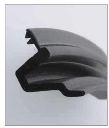
An extrusion with assembly aid coating

Cooper Standard ISG has the ability to coat an entire part or a localized area. Our coatings contain no free silicone that could affect paint systems.