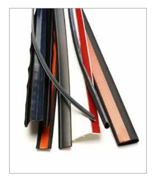
Extrusions that use adhesive tapes

There are three primary PSA joining systems used most widely today: double-coated paper and film tapes, double-coated foam tapes and adhesive transfer tapes. Each system offers specific benefits depending upon the surfaces to be joined, the strength of the bond required and environmental factors such as temperature, ozone/weathering and chemical resistance.